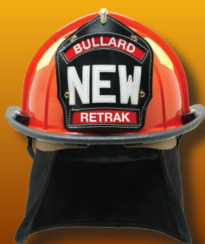
ReTrak Faceshield in stowed position