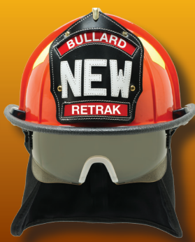
ReTrak Faceshield in deployed position